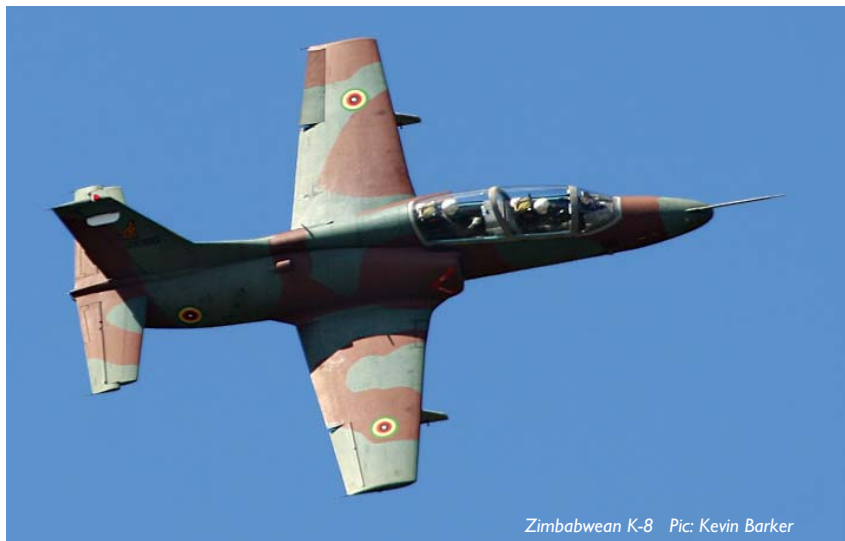
Zimbabwean K-8

The momentum for improved airshow safety has been established. The challenge is to improve even further on airshow safety!