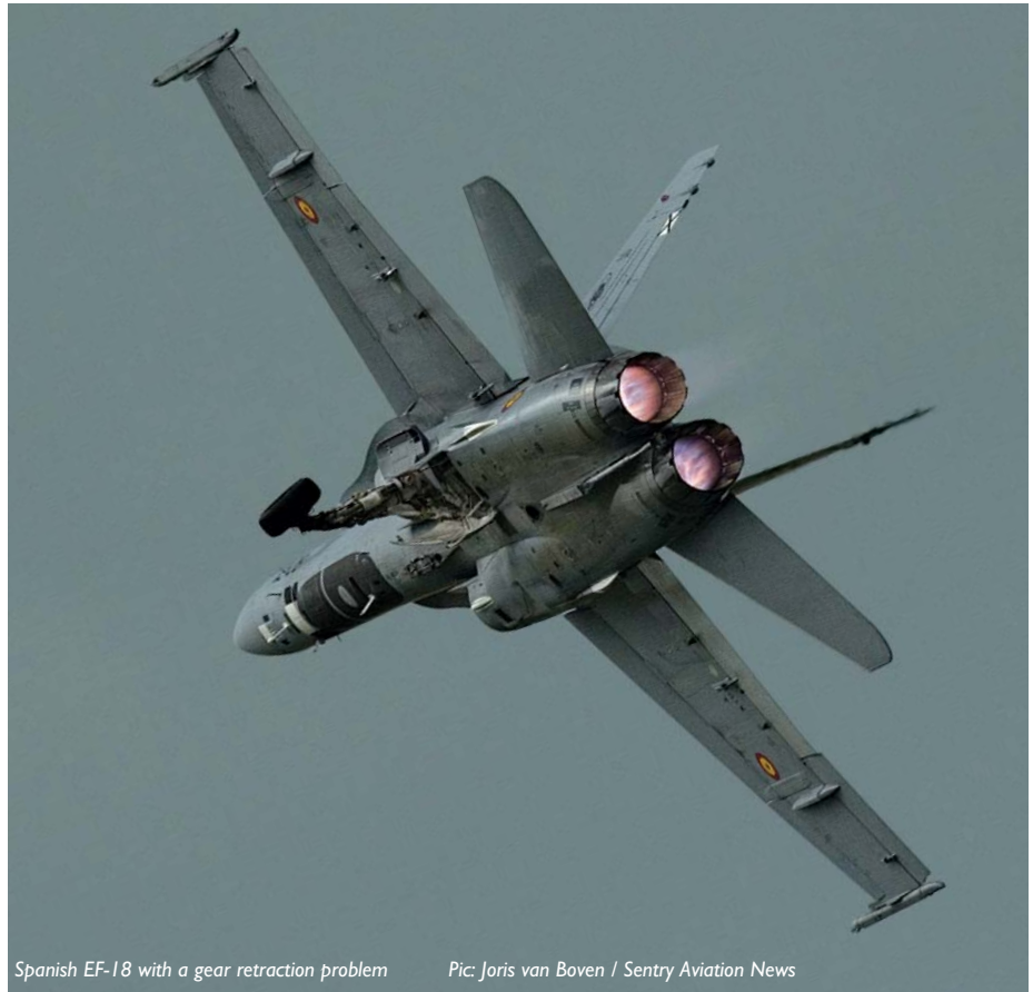
Spanish EF-18 with a gear retraction problem

According to the pilot of the Fokker, he and the accident pilot briefed prior the flight, and the accident pilot departed first in the Nieuport. The Fokker pilot then followed behind the Nieuport while they per-