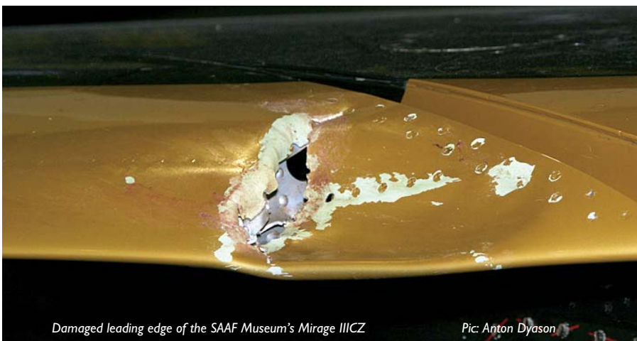
Damaged leading edge of the SAAF Museum's Mirage IIICZ